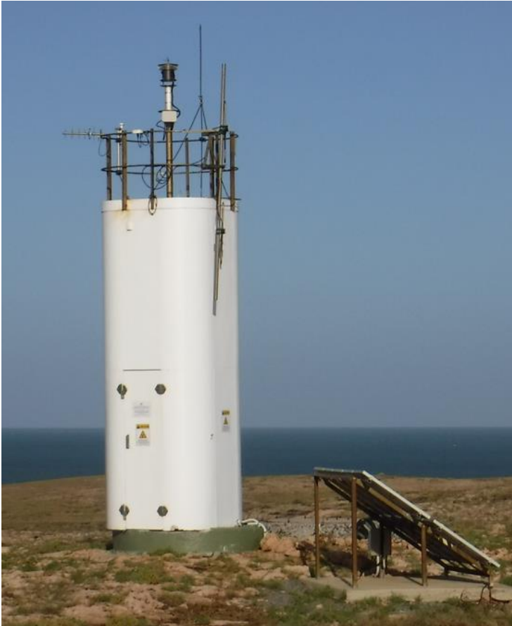
Legendre FRP nav aid

Roam Marine assisted the contractors with access platforms, lifts, transport cradles, erection engineering, demolition, barge stability and seafastenings.