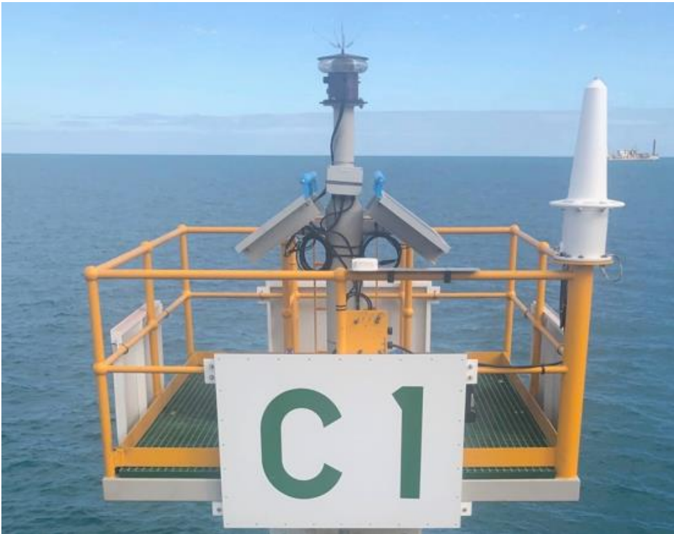
AMSA nav aid Port Hedland

Legendre nav aid was only accessible by helicopter. At Geraldton some of the nav aids were done with Roam Marine access platform and crane barge, while others were done with helicopters and lightweight suspended access deck.