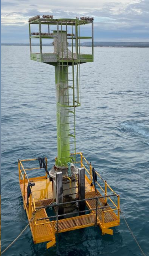
Geraldton nav aid access

Legendre nav aid was only accessible by helicopter. At Geraldton some of the nav aids were done with Roam Marine access platform and crane barge, while others were done with helicopters and lightweight suspended access deck.