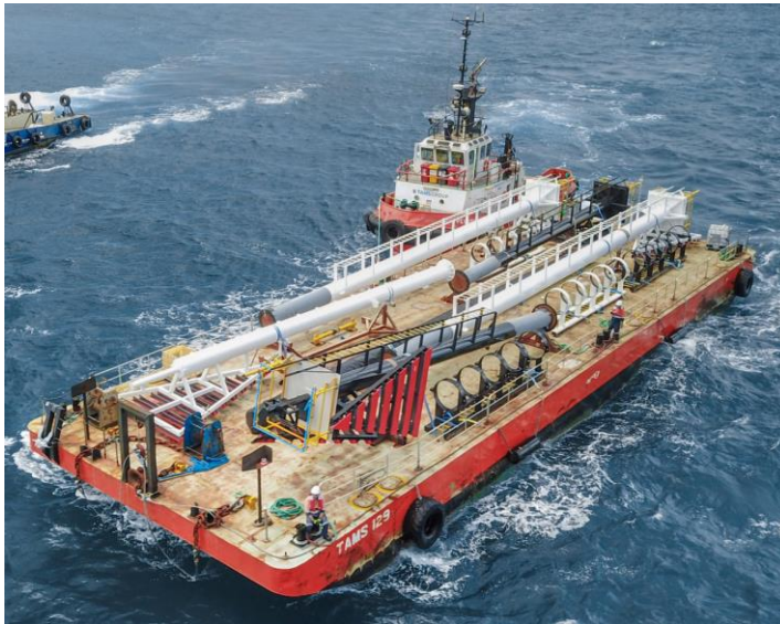
Woodside nav aids

Project: ZJ1272, ZJ1259, ZJ 1242, ZJ 1240, ZJ 1192, ZJ 1162 & ZJ 1044 Client: FMG, FPA, Woodside, PPA, AMSA, Geraldton & Chevron Contractor: Austral, TAMS, Tideland, Maritime Year: 2014 - 21