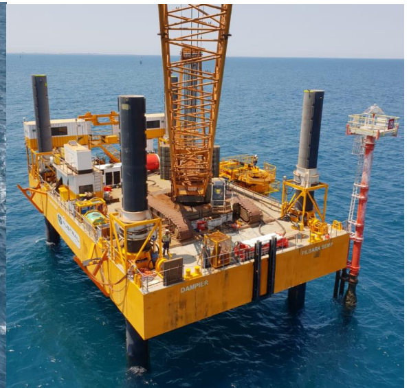
JUB driving nav aid piles at Port Hedland

Roam Marine designed nav aids including wave loads, piling, boat bumpers, FRP platforms, cathodic protection, pile clamps, fall arrest, lights, lead triangles and solar panels.