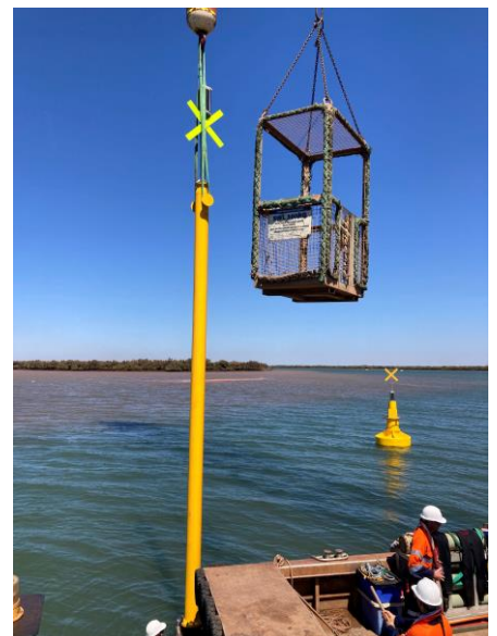
FMG gravity nav aid