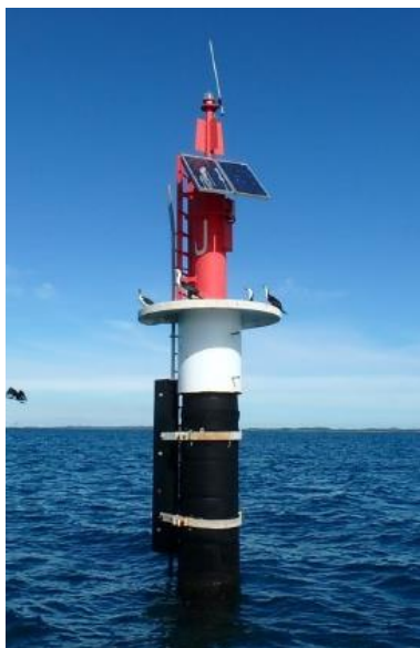
Fremantle nav aid

FMG nav aid was a gravity base rather than piled.