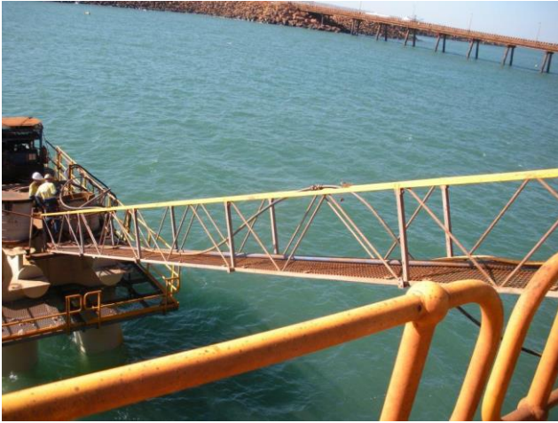
Modular flatpack 15m span catwalk