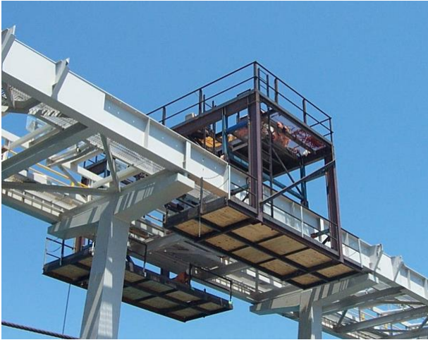
Conveyer module install – rolling platform

Mb 0413 933 163 Phone 9381 9091 Email mhannaford@roam-marine.com Web www.roam-marine.com