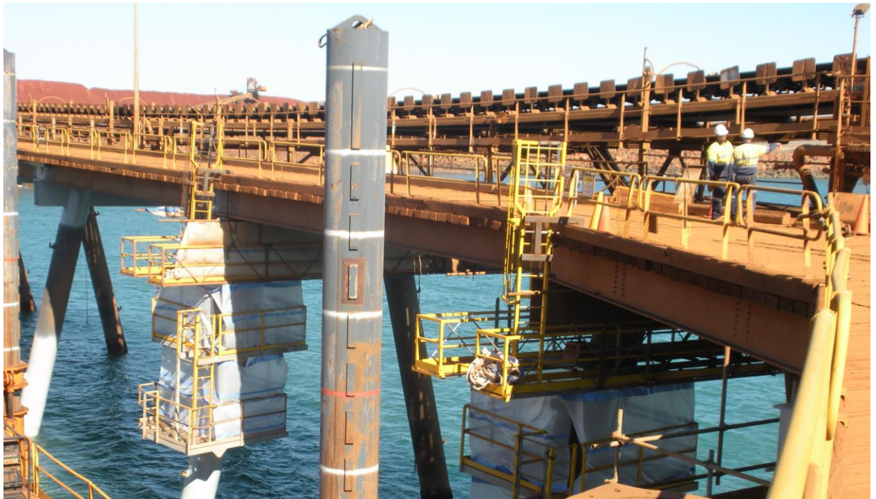
Pile painting with twin level horseshoe platforms + twin modular flatpack walkways along headstocks + ladder access to deck level