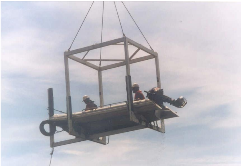
Zodiac lifting frame