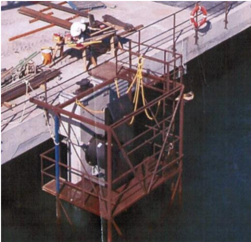
Fender access multilevel platform