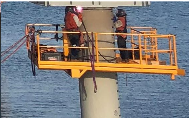
Pile cutoff horseshoe – adjustable diameter and rake