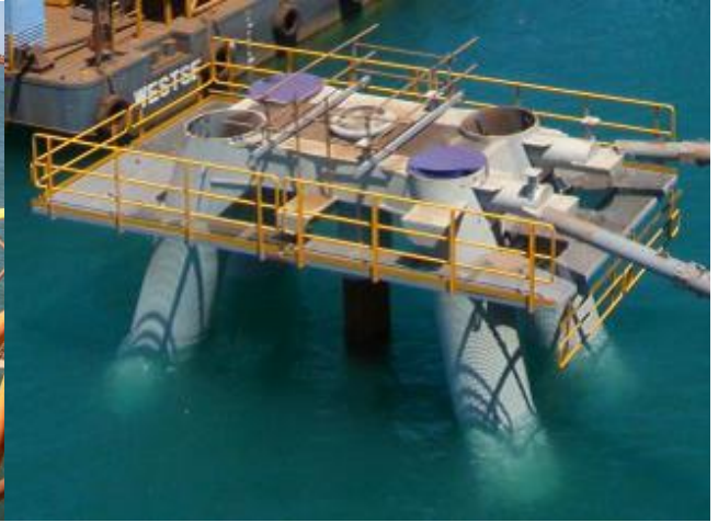
Dolphin cap access deck