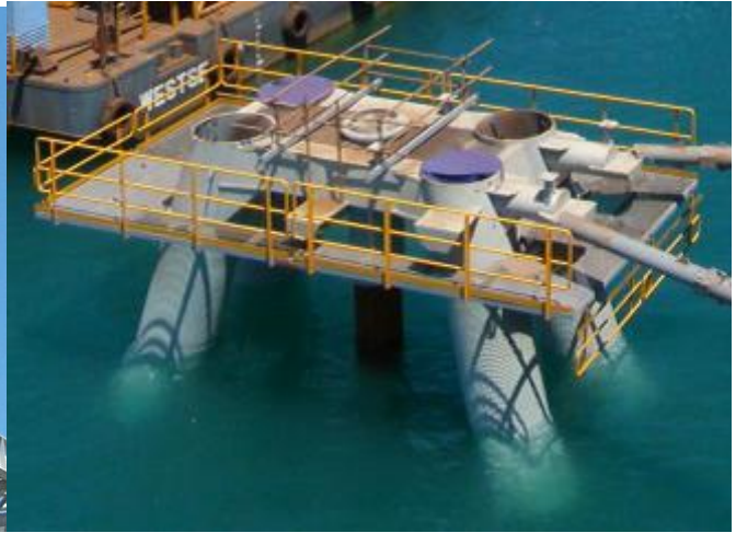
Dolphin cap access deck