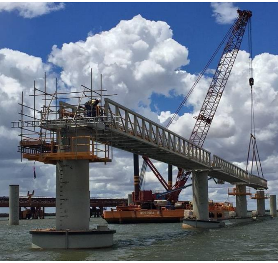
Walkway being installed