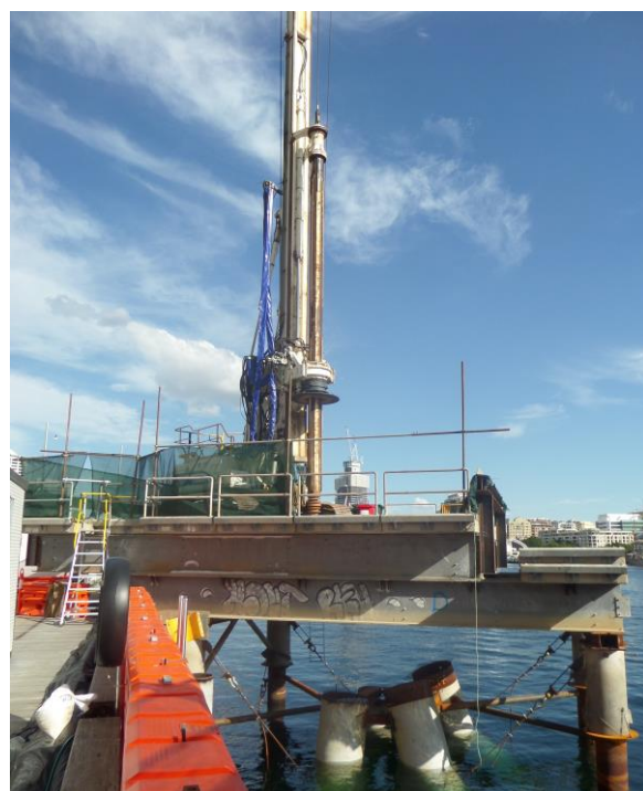
Temporary Jetty with Drill Rig